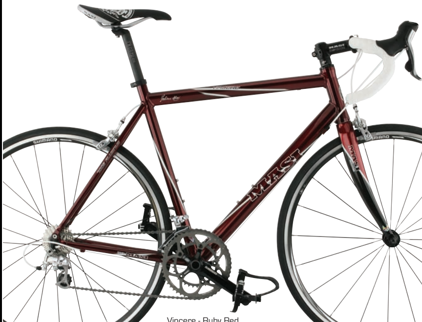
Vincere - Ruby Red

The Vincere makes no excuses and takes no prisoners. You can rest assured knowing that it is money well spent. Well spent indeed.