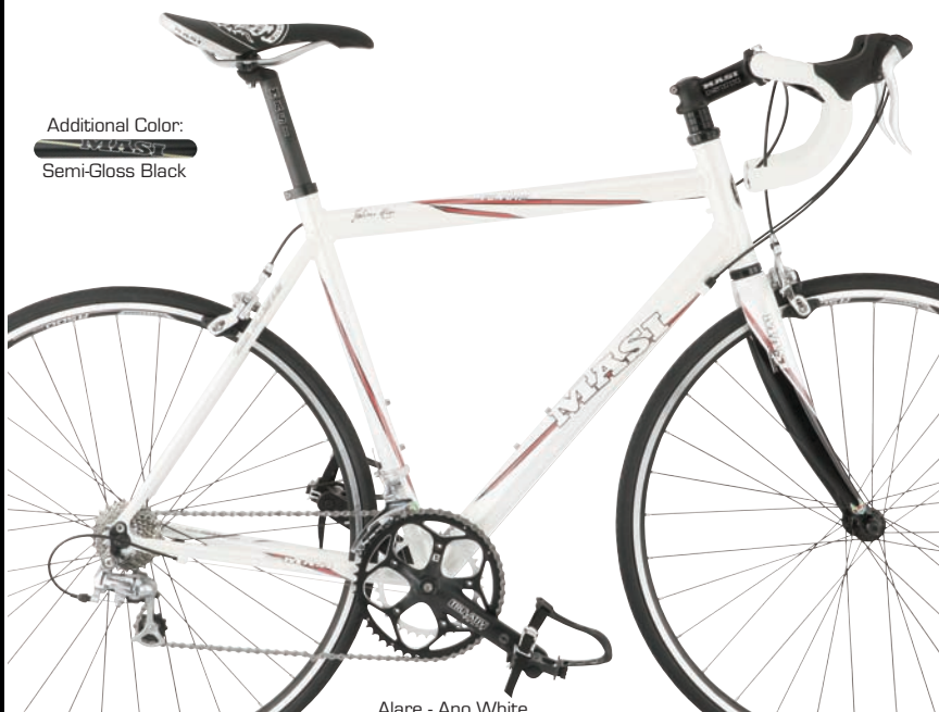
Alare - Ano White

The compact crankset provides excellent climbing and sprinting gears with a more streamlined and lightweight drivetrain and the bar-top brake levers add a level of safety when riding on the tops of the bars. It's the ideal way to begin a long-term relationship with the road.