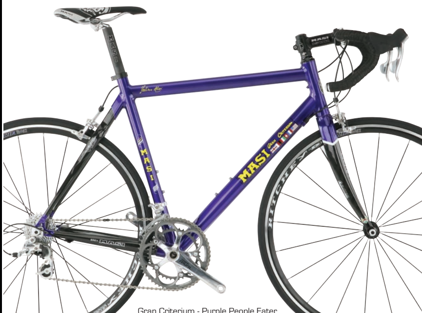
Gran Criterium - Purple People Eater

By combining the vintage graphics with a classic color and a contemporary parts mix and frame, we've come up with the next chapter in the great legacy of the Gran Criterium.