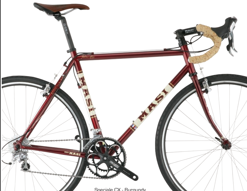
Speciale CX - Burgundy