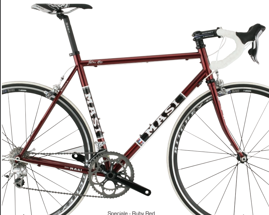
Speciale - Ruby Red