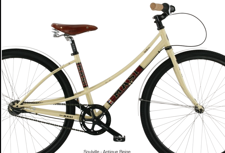
Soulville - Antique Beige