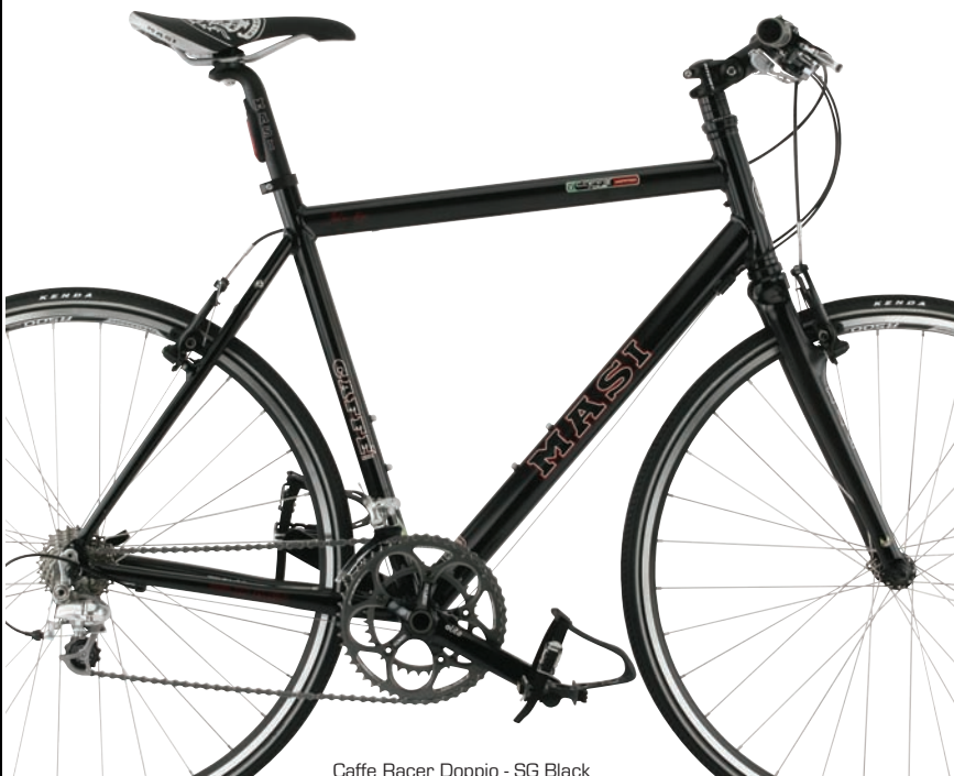
Caffè Racer Doppio - SG Black