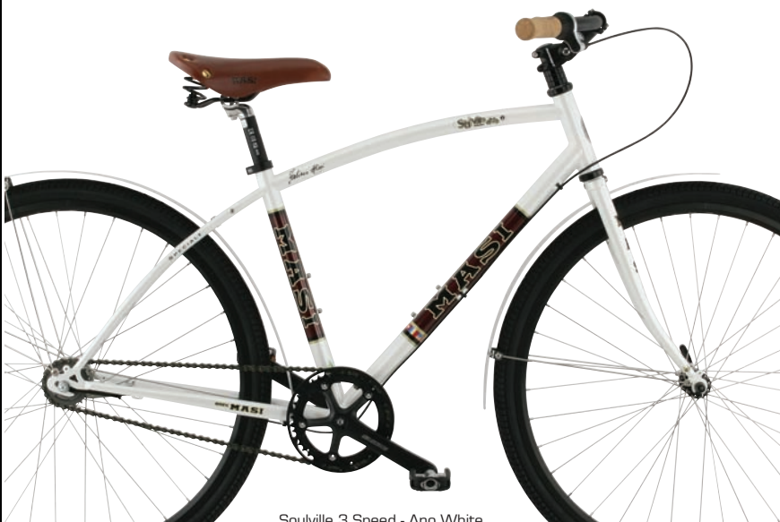
Soulville 3 Speed - Ano White