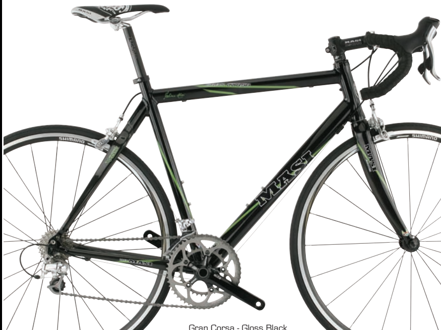
Gran Corsa - Gloss Black

This bike loves long rides and endless hours on the road. Find your favorite descent and push yourself as hard as you push the bike and you'll be rewarded with superb cornering and a smile that'll begin to hurt after awhile. Sprinting is just as rewarding, thanks to the stiff and responsive carbon fiber seat and chain stays. Who says you can't have your cake and eat it too?