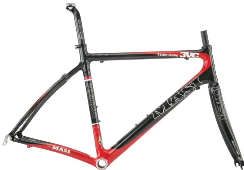
3VC TEAM ISSUE - Rosso Red

Your dreams have been answered- light, stiff, comfortable and ready for your personal touch. The 3VC Team Issue is a pure speedster and is ready to go toe to toe with anybody anywhere. Whether you're a SRAM fan, a Campy freak or bleed Shimano blue, the Team Issue is ready and waiting. They say the taste of victory is sweet- here's to finding out.