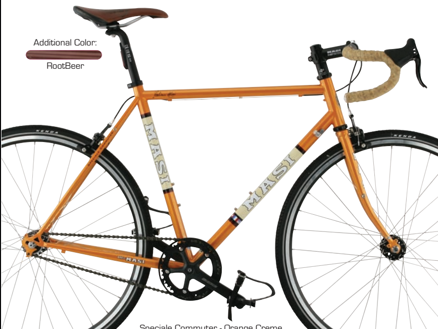
Speciale Commuter - Orange Creme

How can you go wrong with classic touches like the simple randonneur handle bars, Dia-Compe long reach caliper brakes and long horizontal drop outs? It's a classic bike that's ready for further customization to suit your tastes, as well as your dreams.