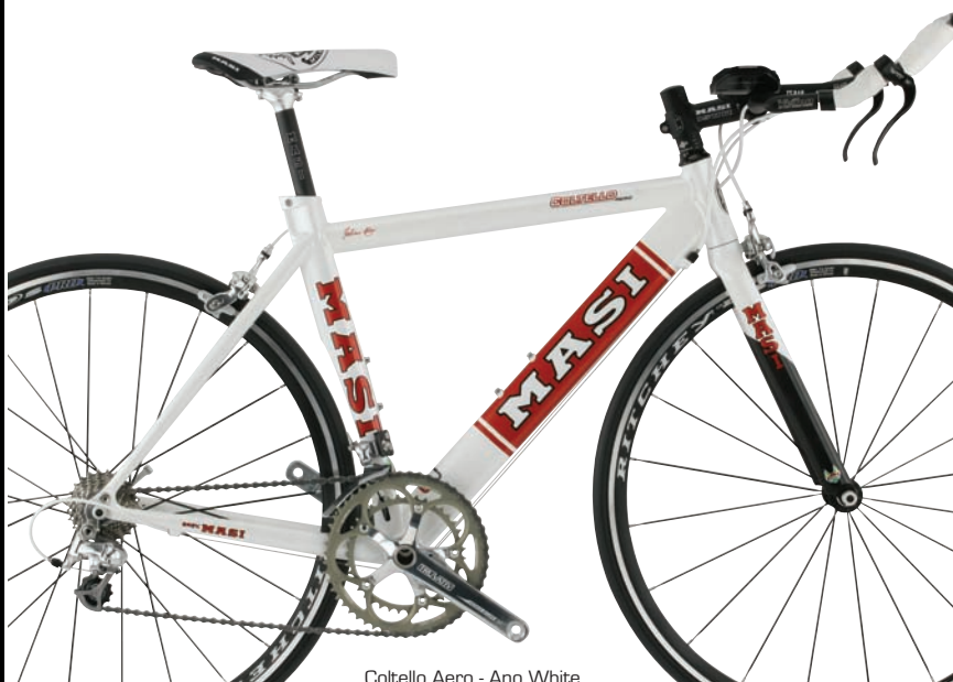
Coltello Aero - Ano White

In a world full of pretenders, why not pick the real thing? You'll be happy you did.