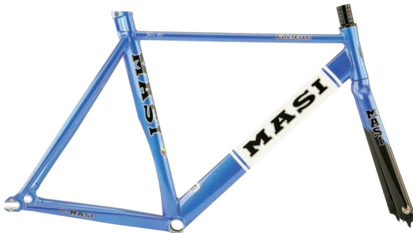
Coltello Aero - Metallic Blue

No shrinking violet, this frame and fork is designed with a high bottom bracket for crank arm clearance on the steepest of tracks and with replaceable dropout inserts for the frequent wheel changes of track racing. The top tube is shaped to resist twisting at the head tube and the rear stays are square-profiled for maximum power transfer. If you have a desire for unadulterated power and speed, then look no further- and don't look back.