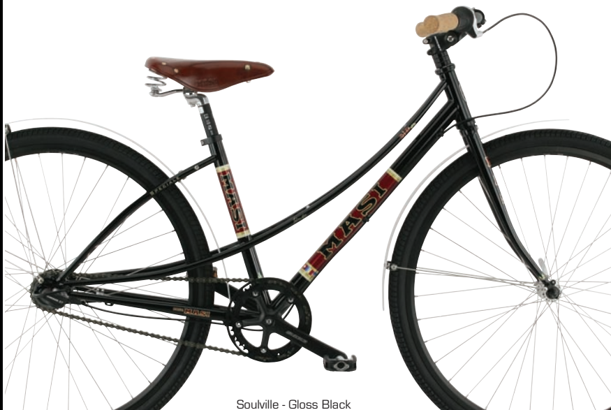
Soulville - Gloss Black