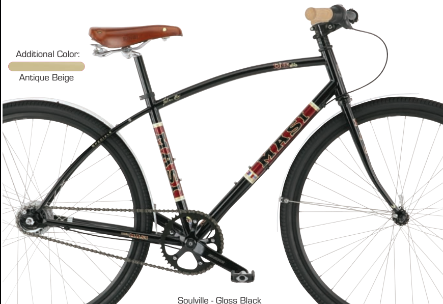
Soulville - Gloss Black