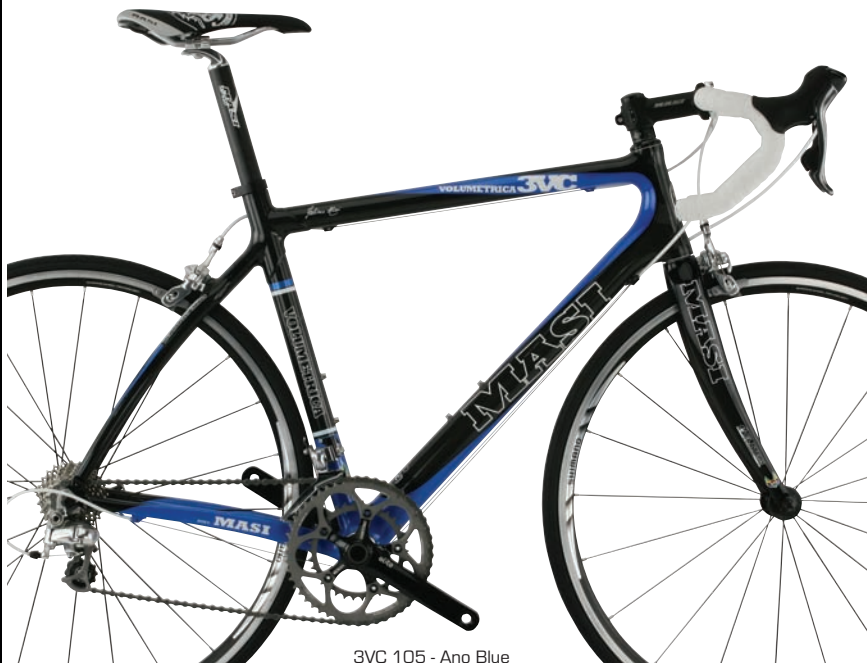
3VC 105 - Ano Blue