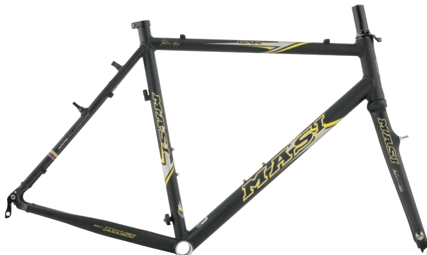
CXR - Matte Black

The same platform as the complete CXR, but left blank for your creative touches, the CXR frameset is ready and waiting for you. Designed as a cyclo-cross race bike, but equally suited to being a fantastic adventure bike ready to traverse asphalt, gravel roads and dirt roads all in the same day. Get as creative as you like- you won't be disappointed.