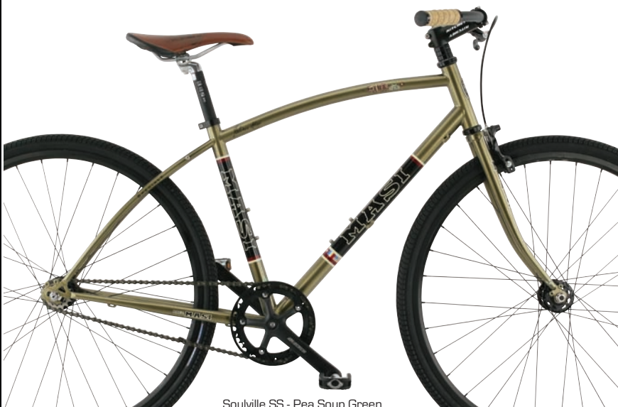
Soulville SS - Pea Soup Green