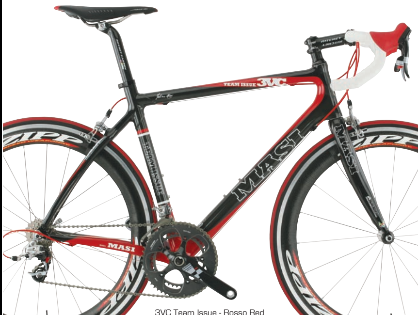
3VC Team Issue - Rosso Red