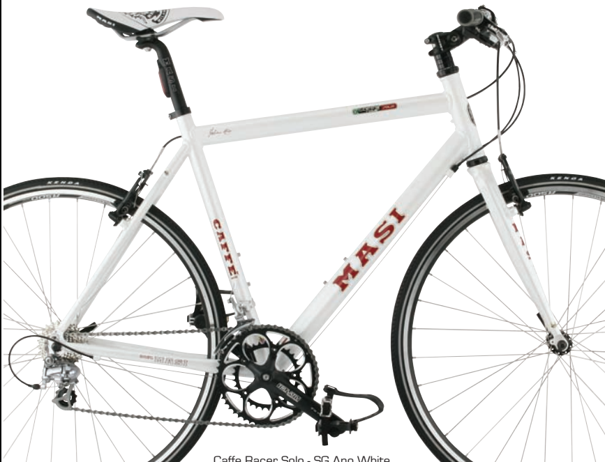
Caffè Racer Solo - SG Ano White