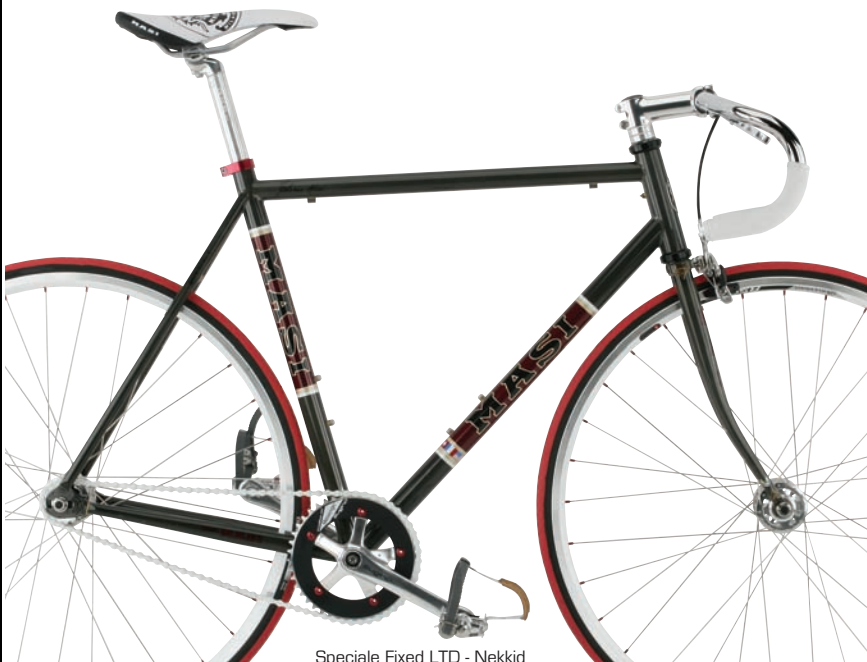
Speciale Fixed LTD - Nekkid

The unpainted steel frame comes with a clear coat over the tubing and decals, but rust is part of the intended look- as if you stripped the finish yourself.