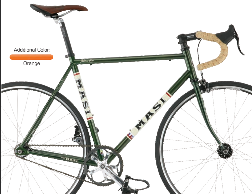
Speciale Fixed - Shamrock Green

The honest-to-goodness rear track dropouts (or fork ends, for you purists) are perfect for adjusting your gearing to fit the needs of the day. Along with the custom dropouts, the frame also has cable guides for those who prefer two brakes to one and a full complement of bottle bosses so you can take your water bottles out of your jersey on those long winter training rides. Basically, we thought of it all so you wouldn't have to- you can thank us later.