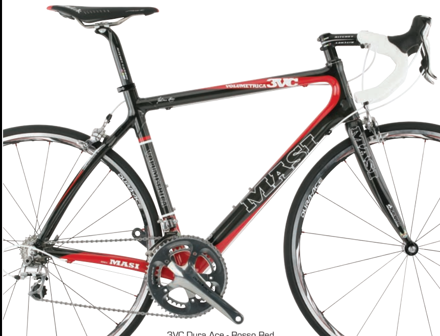
3VC Dura Ace - Rosso Red