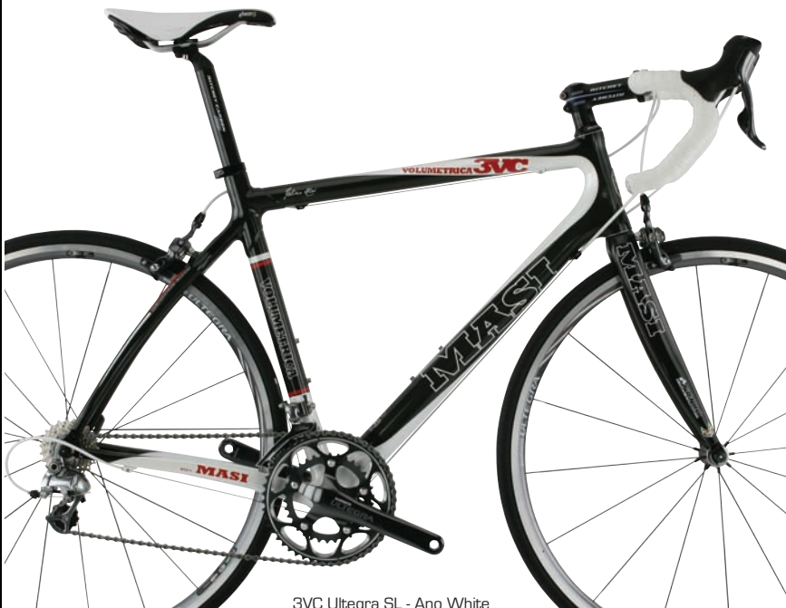
3VC Ultegra SL - Ano White