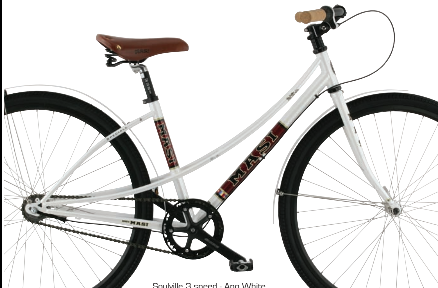
Soulville 3 speed - Ano White