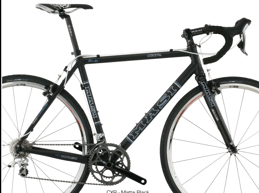
CXR - Matte Black

Already becoming a legend, the venerable CXR remains virtually unchanged, other than an updating of the graphics. This new look blends a retro vibe with a modern twist. The stealthy matte black remains and still looks good dirty or clean. Race ready, straight out of the box, the CXR is all about carving precise lines and getting through the muck and the mire with total predictability. The race geometry and carbon fork deliver phenomenal handling and the budget-friendly parts mix won't leave you sleeping in your car.