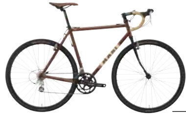
CX Uno Pg. 24