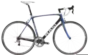
Evo Ultegra Pg. 9