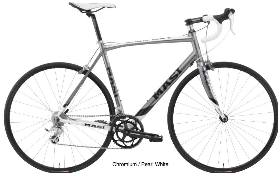
Chromium / Pearl White