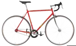
Drop Pg. 37