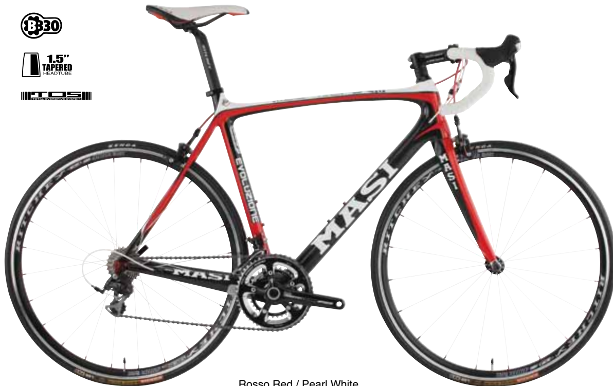
Rosso Red / Pearl White