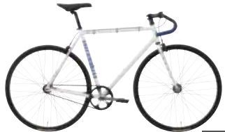
Uno Drop Pg. 38