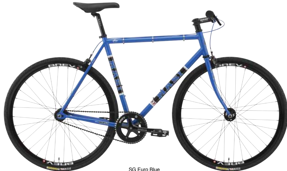
SG Euro Blue