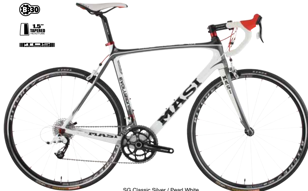
SG Classic Silver / Pearl White