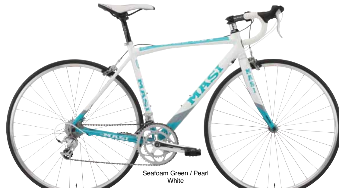
Seafoam Green / Pearl White