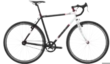
CX SS Pg. 25