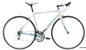
Alare Bellissima Pg. 18