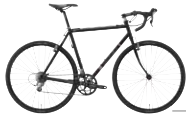
CX Pg. 23