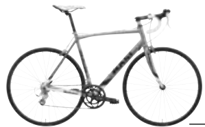
Partenza Pg. 19