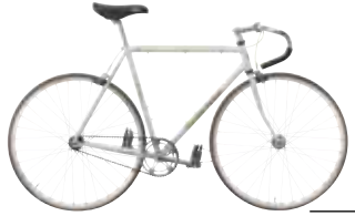
Fixed Ultimate Pg. 34-35

Masi develops and creates some of the most desirable fixed gear and single speed bikes on the planet. We stay true to our heritage by using traditional materials and methods with only the highest standards in quality. Our fixed/ SS models each have very unique personalities, just like the people who like to ride them.