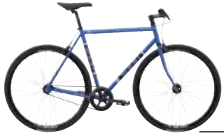
Riser Pg. 36