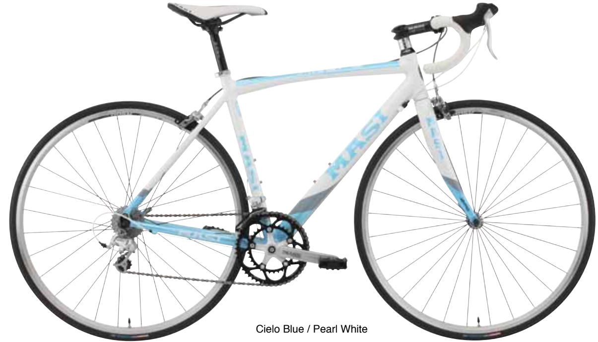
Cielo Blue / Pearl White