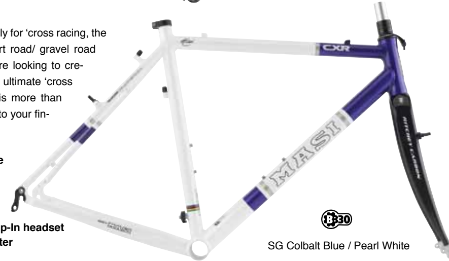
SG Colbalt Blue / Pearl White