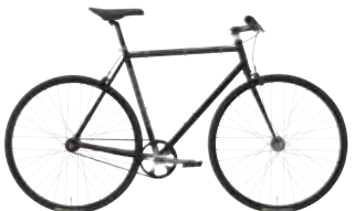
Uno Riser Pg. 39