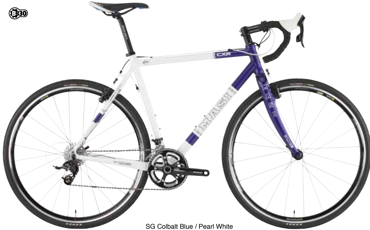
SG Colbalt Blue / Pearl White