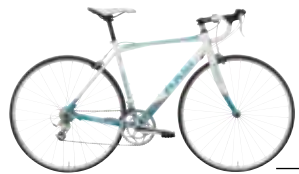
Partenza Bellissima Pg. 20