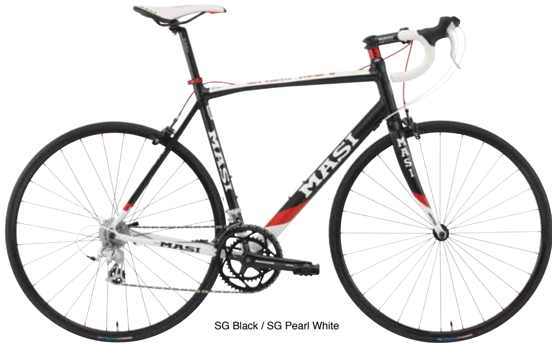
SG Black / SG Pearl White