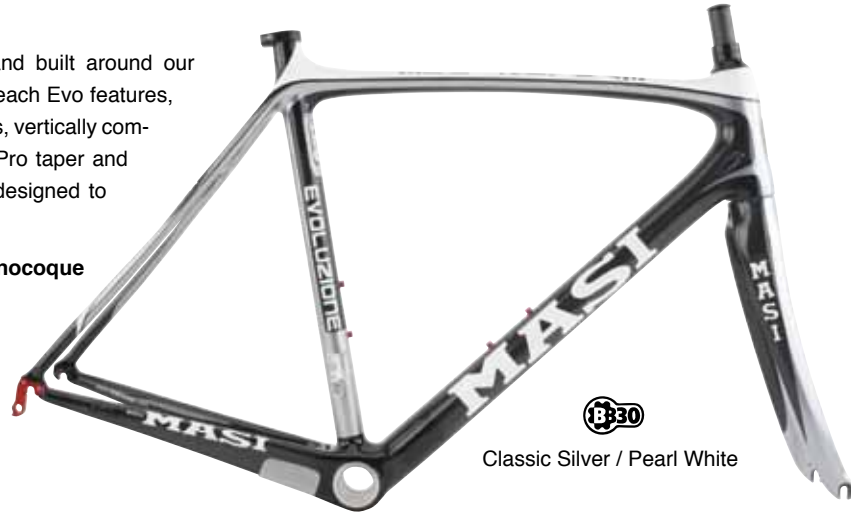
Classic Silver / Pearl White