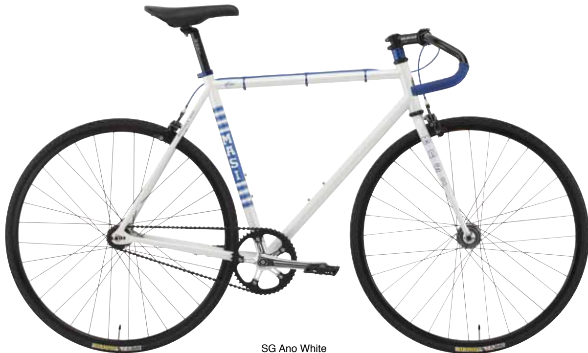
SG Ano White