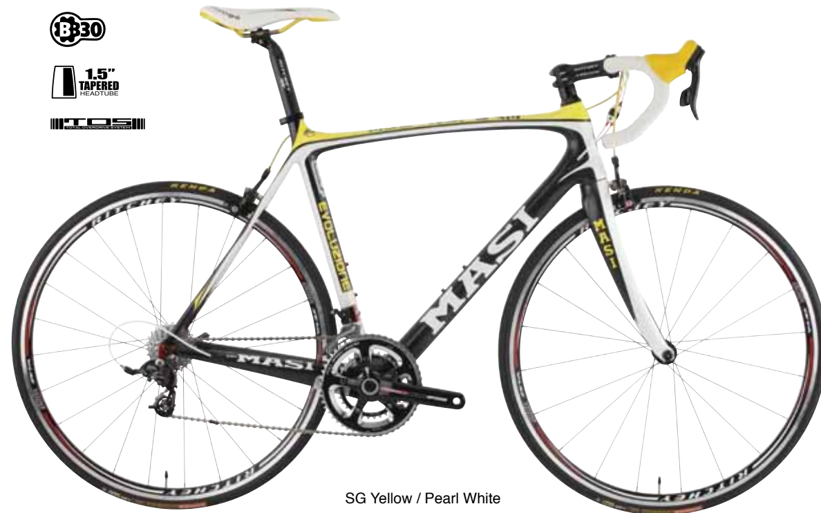
SG Yellow / Pearl White