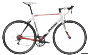
Vincere & Vincere Bellissima Pg. 15-16

New and completely redesigned for 2012, our Performance Series frames feature a redesigned tubeset highlighting internal brake cable routing, a feature normally found on bikes well above these price points. Though the bikes look racier than ever, they maintain that perfect harmony between agility and stability; with longer wheelbases, shorter top tubes and a more up-right riding position, they are ideally suited for long days in the saddle.