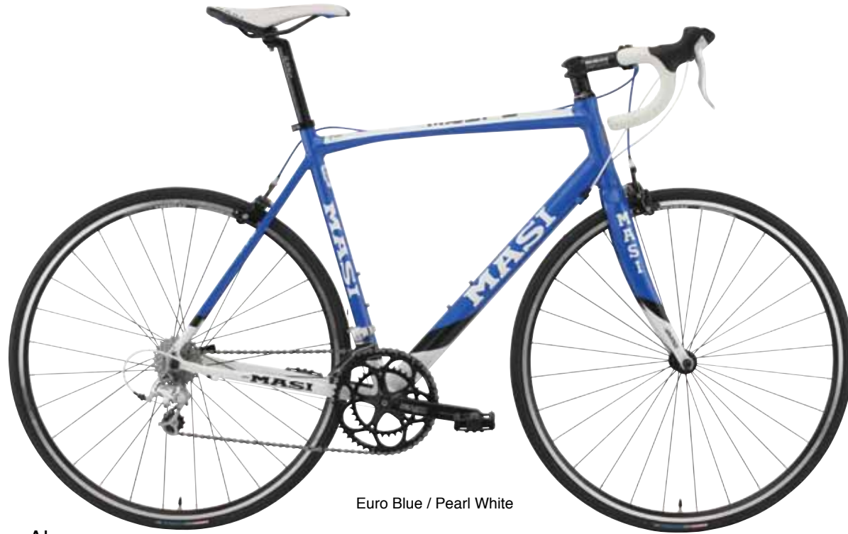
Euro Blue / Pearl White