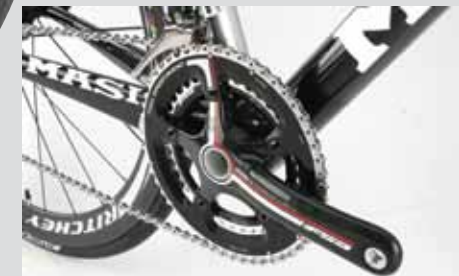
Classic Silver / Pearl White