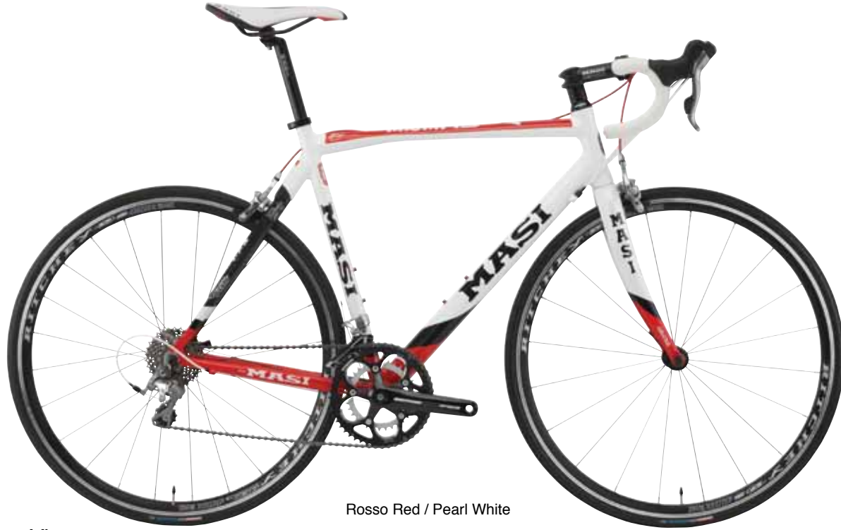
Rosso Red / Pearl White