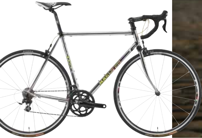
Gran Criterium Pg. 28-29

Cycling's history was essentially born out of steel and all Masi steel bikes use 100% drawn chromoly tubing- we don't use seamed tubing or hi-tensile steel on anything we make. Neither seamed tubing nor hi-ten can hold up long term to the rigors of regular riding and neither provide the ride quality of chromoly. Because even plain gauge chromoly rides better than double butted seamed tubing, you can rest assured that every Masi in the Steel series will ride like a classic steel bike should.