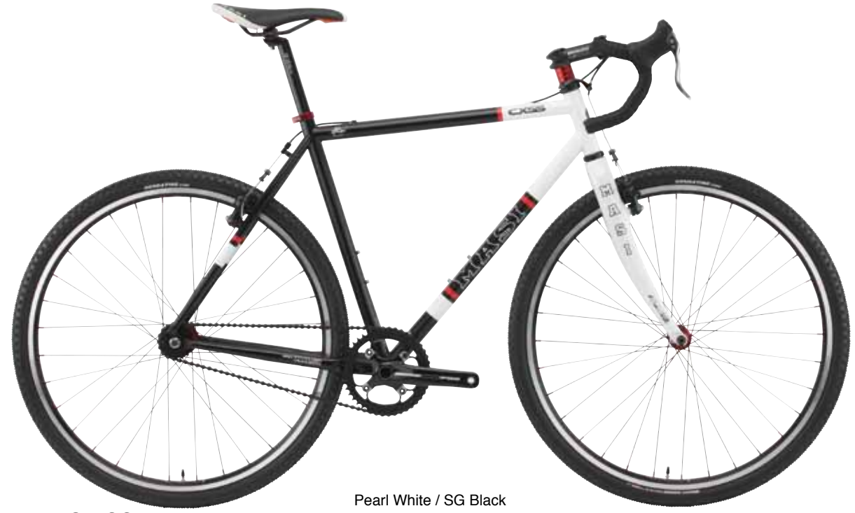
Pearl White / SG Black