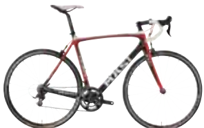
Evo 105 Pg. 10