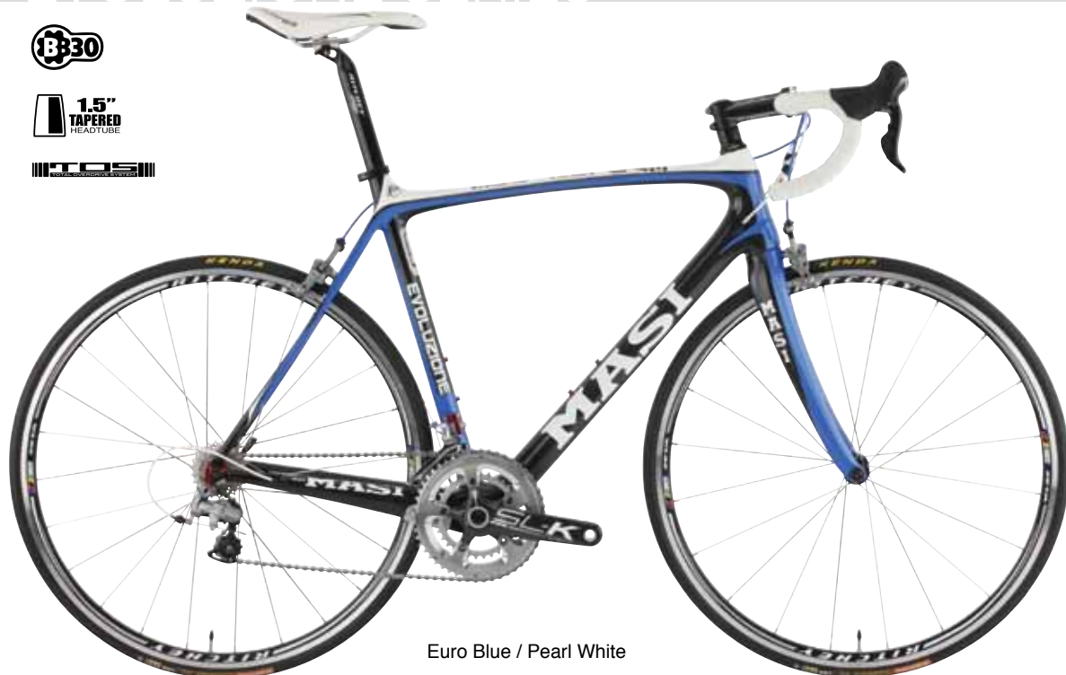
Euro Blue / Pearl White