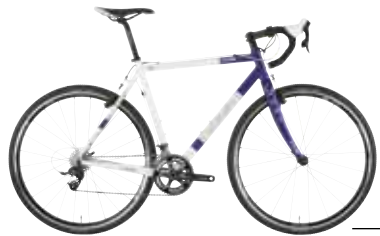
CXR Pg. 22

Masi built its history with race bikes that were bred from competition. Because of snow and inclement weather, many racers struggled to ride standard road bikes, and thus, cross bikes were born. These bikes were able to not only ride on rough roads but even on trails and through mud. Our Cyclocross series has been built to withstand the rigors of whatever you're willing to throw at them. Although designed to be ridden hard toward a finish line, they are also very happy to help you simply enjoy riding at your best; checkered flag or not.