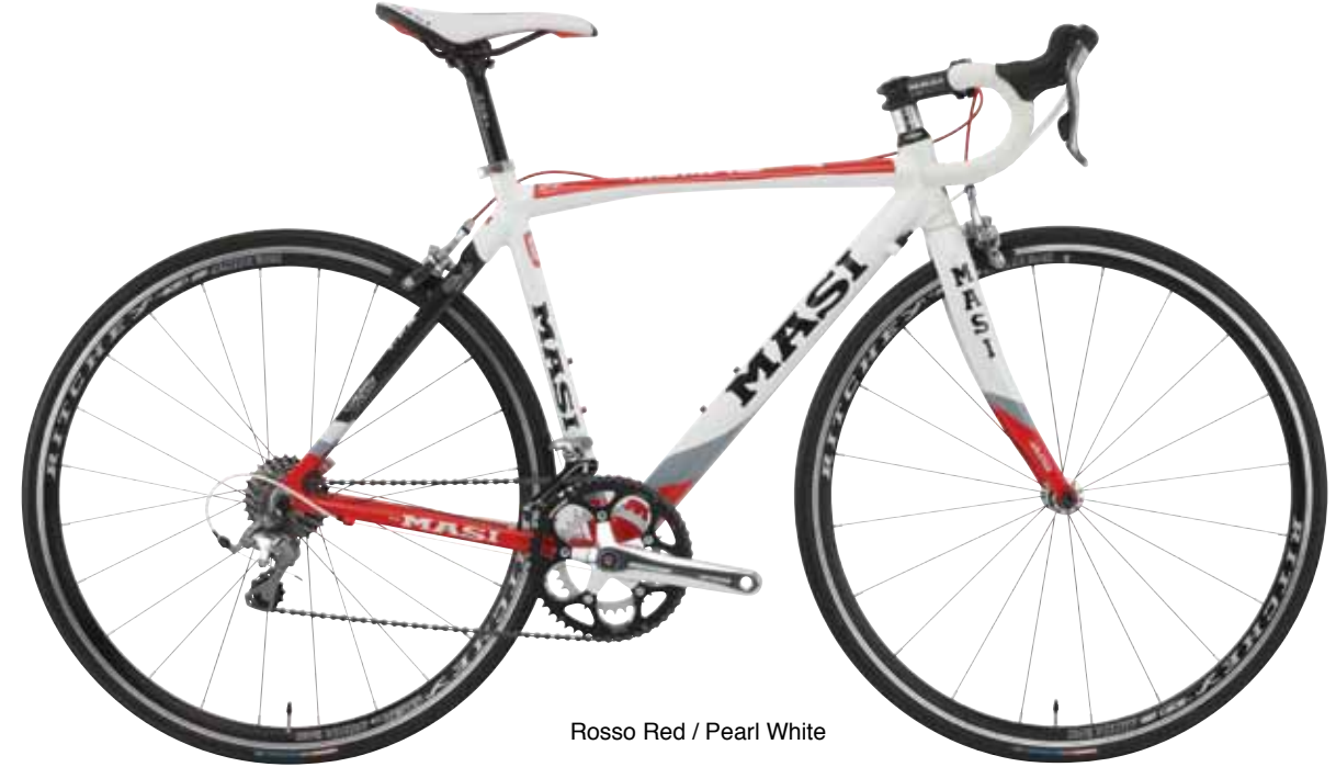
Rosso Red / Pearl White