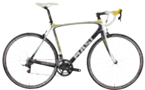
Evo Force Pg. 8