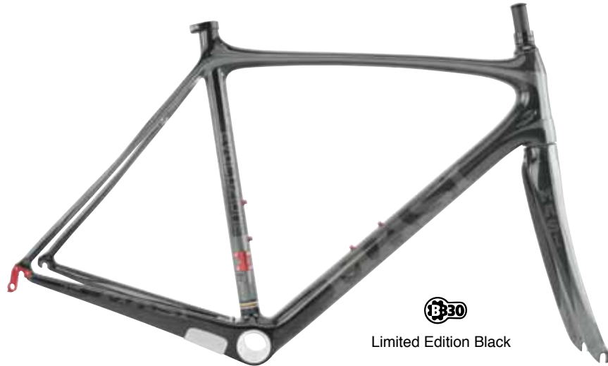
Limited Edition Black