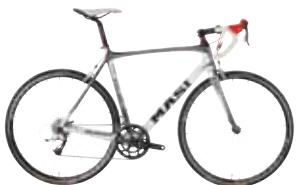
Evo Apex Pg. 11