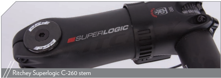
Ritchey Superlogic C-260 stem

TOS TOTAL OVERDRIVE SYSTEM MC7 ULTRA HIGH MODULUS