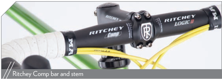
Ritchey Comp bar and stem