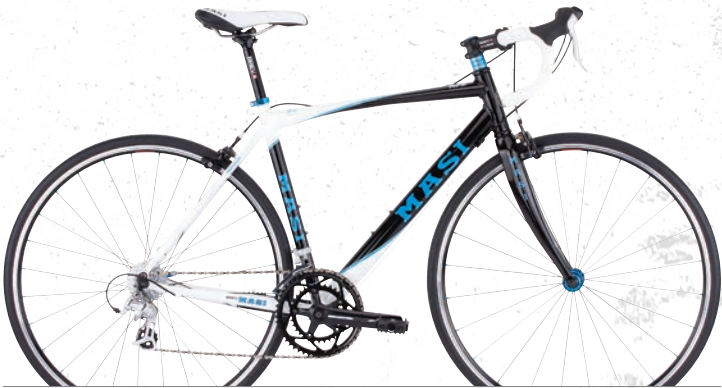
MA4 6000 DOUBLE-BUTTED AL