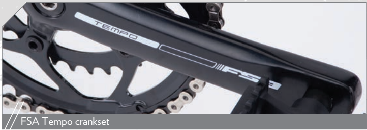
FSA Tempo crankset