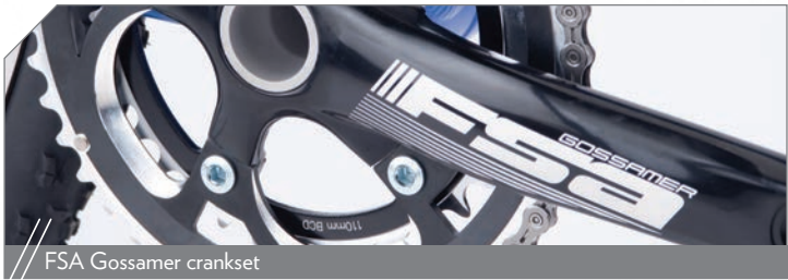
FSA Gossamer crankset