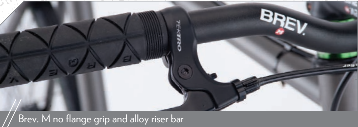
Brev. M no flange grip and alloy riser bar