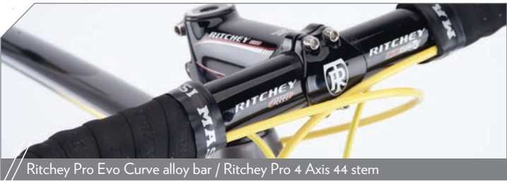
Ritchey Pro Evo Curve alloy bar / Ritchey Pro 4 Axis 44 stem