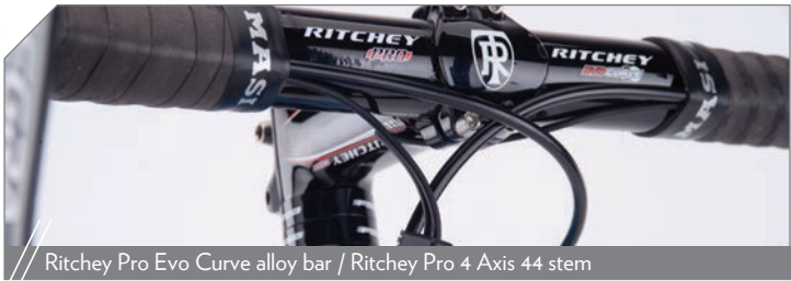
Ritchey Pro Evo Curve alloy bar / Ritchey Pro 4 Axis 44 stem

TOS TOTAL OVERDRIVE SYSTEM MC7 ULTRA HIGH MODULUS