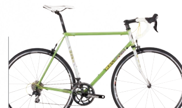
GRAN CRITERIUM // 38

In an age where most other manufacturers have abandoned their steel roots, Masi holds true to its heritage, for steel is what the iconic Masi name was built from. All Masi steel bikes are made from 100 percent drawn chromoly tubing because it delivers a superior ride designed to last a lifetime. So whether you choose the legendary Gran Criterium made with Reynolds 525 tubing and lug construction or prefer the more urban Uno and Riser fixed gear singlespeeds, every steel Masi is made with the same style and passion "The Tailor" put into every one of his own moving works of art.