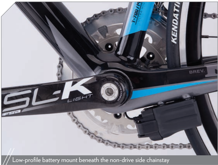
Low-profile battery mount beneath the non-drive side chainstay