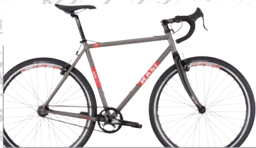
CXSS // 34

For those Luddites who simply refuse to accept the conveniences of the modern world, the CXSS is made especially for you. Stripping away all the frivolity of shifting, the double butted steel CXSS shares the same aggressive geometry and integrated Masi Elite/RS carbon fiber fork of the CXR, but swaps horizontal track dropouts so you can roll with “one on it”.