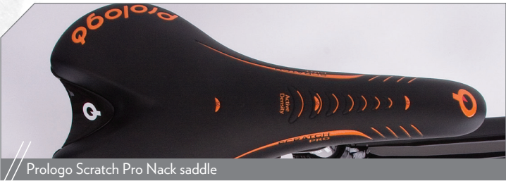
Prologo Scratch Pro Nack saddle