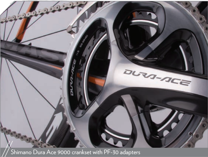
Shimano Dura Ace 9000 crankset with PF-30 adapters