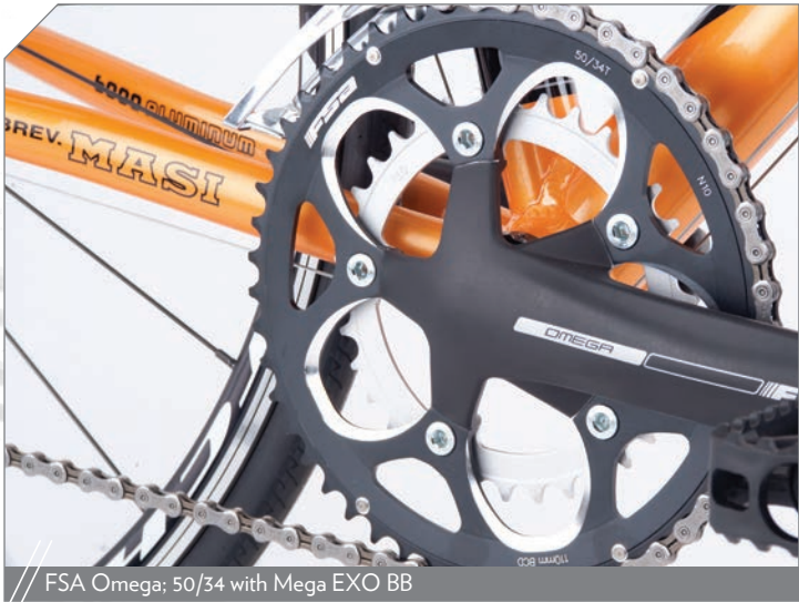
FSA Omega; 50/34 with Mega EXO BB