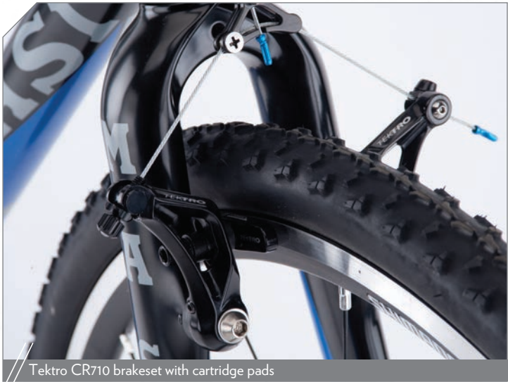
Tektro CR710 brakeset with cartridge pads