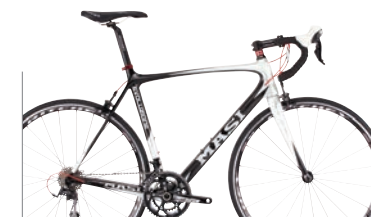
105 // 11