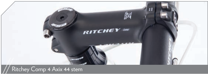
Ritchey Comp 4 Axis 44 stem