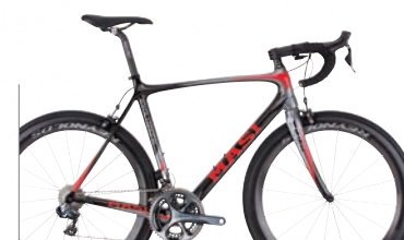
DURA ACE DI2 // 06