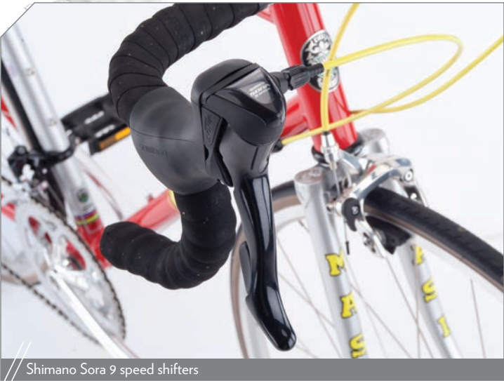
Shimano Sora 9 speed shifters