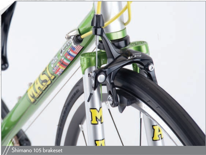
Shimano 105 brakeset