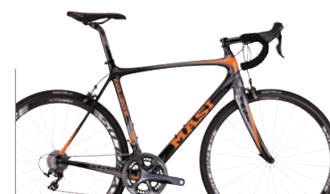
DURA ACE // 07