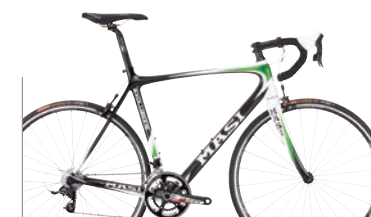
RIVAL // 10