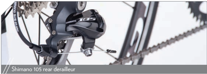
Shimano 105 rear derailleur