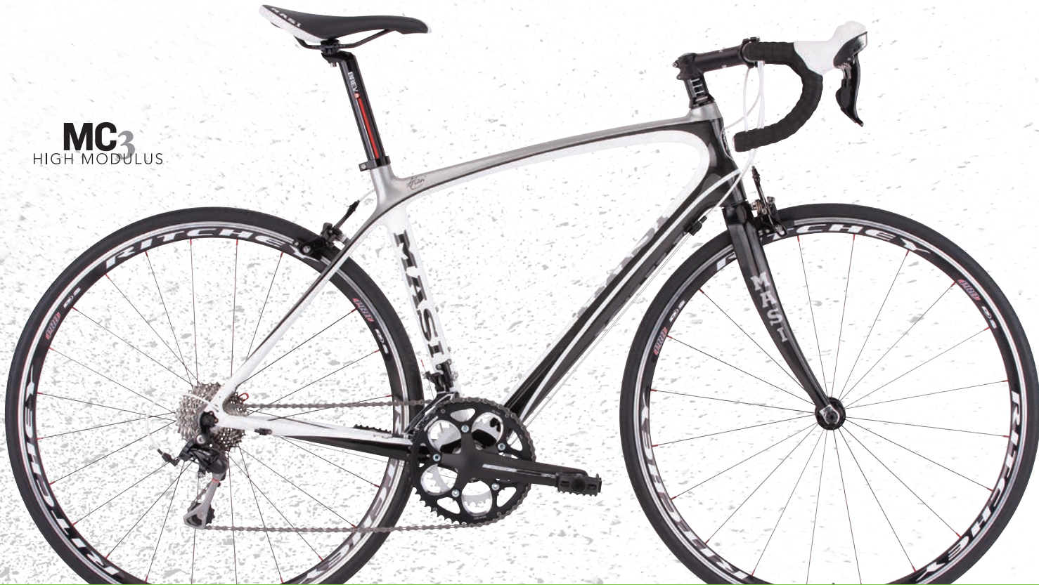
MC3 HIGH MODULUS