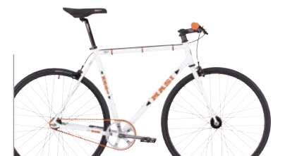
UNO RISER/DROP // 41