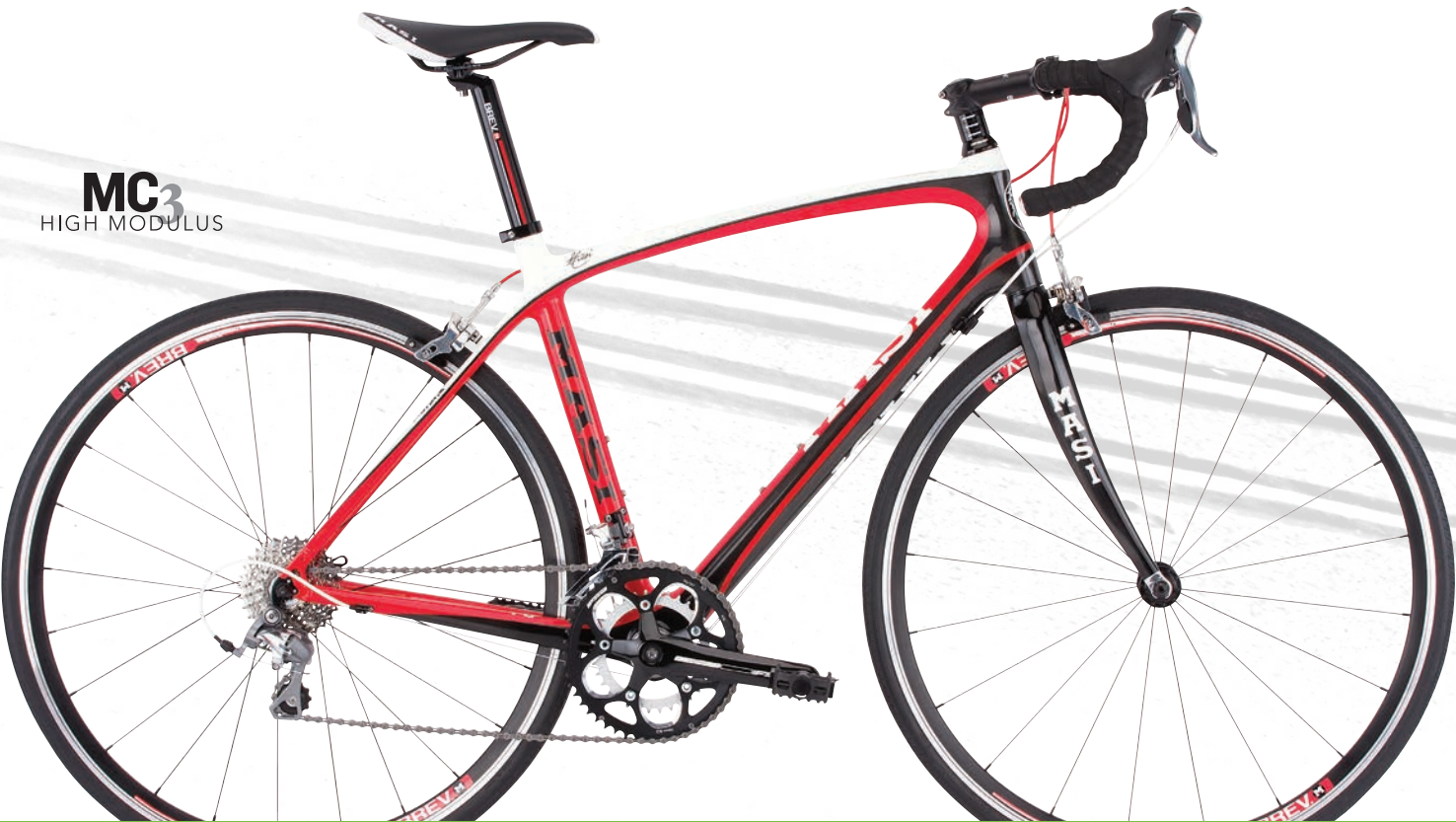
MC3 HIGH MODULUS