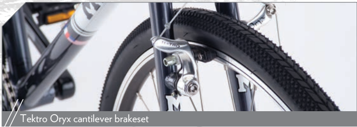
Tektro Oryx cantilever brakeset