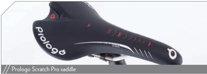
Prologo Scratch Pro saddle