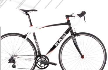
INIZIO // 27

Dating back to the 1970s, the Gran Corsa is a name synonymous with timeless style, elegance and performance, and the modern iteration of this classic is no different. Featuring a perfect blend of traditional design with modern geometry and components from Shimano, FSA and Ritchey, the Masi MA4 double-buttressed aluminum Gran Corsa with internal brake cable routing, integrated headtube and tight, aggressive geometry continues the legacy of this bicycle legend.