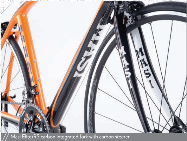
Masi Elite/RS carbon integrated fork with carbon steerer