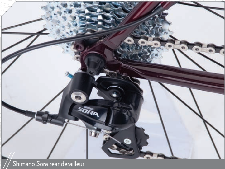
Shimano Sora rear derailleur