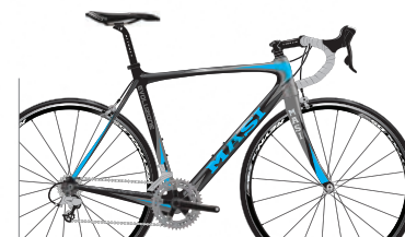
ULTEGRA DI2 // 08