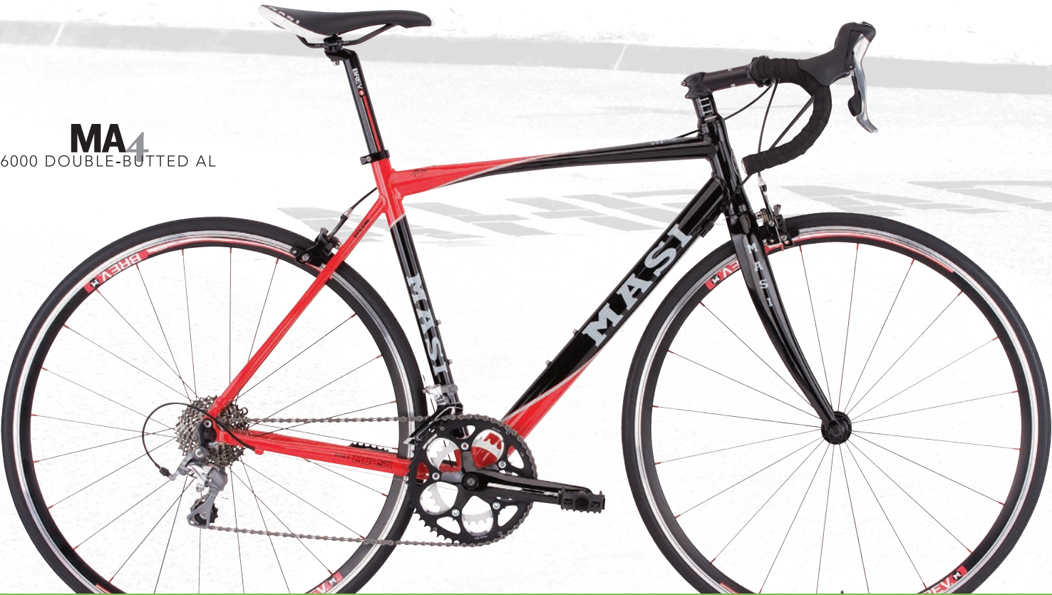
MA4 6000 DOUBLE-BUTTED AL

Everyone remembers their first real race bike, for it was the machine that helped them transition from bike rider to bike racer. The Vincere is exactly that machine, featuring a remarkable blend of performance and value thanks to its Masi MA4 double-buttressed aluminum frame with internal brake cable routing, integrated headtube and tight aggressive geometry. Both standard and womens-specific Bellissima models sport Shimano Tiagra shifting and high-quality FSA and Brev. M. components.