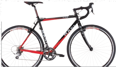
CXR // 31