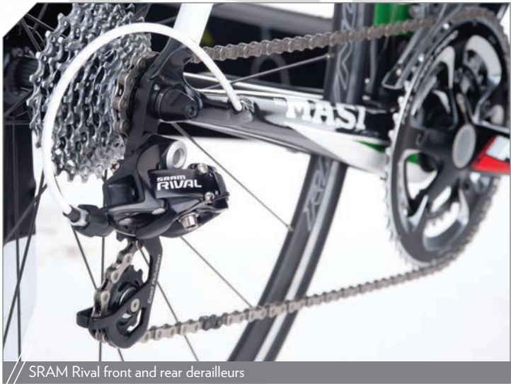
SRAM Rival front and rear derailleurs