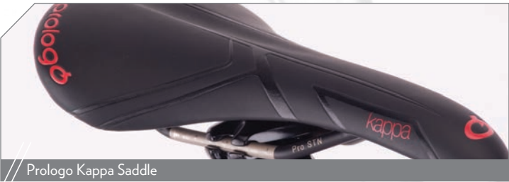
Prologo Kappa Saddle