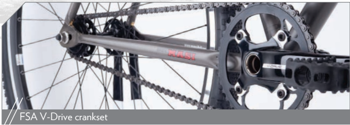
FSA V-Drive crankset