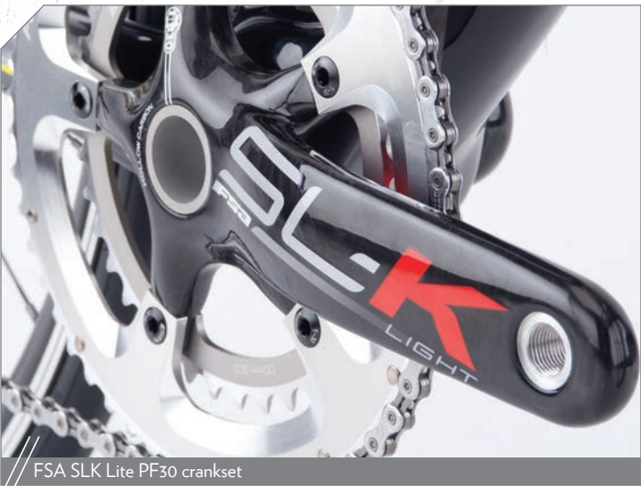
FSA SLK Lite PF30 crankset