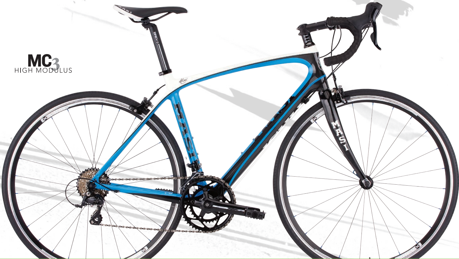
MC3 HIGH MODULUS