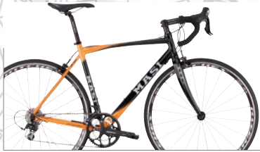
GRAN CORSA // 22