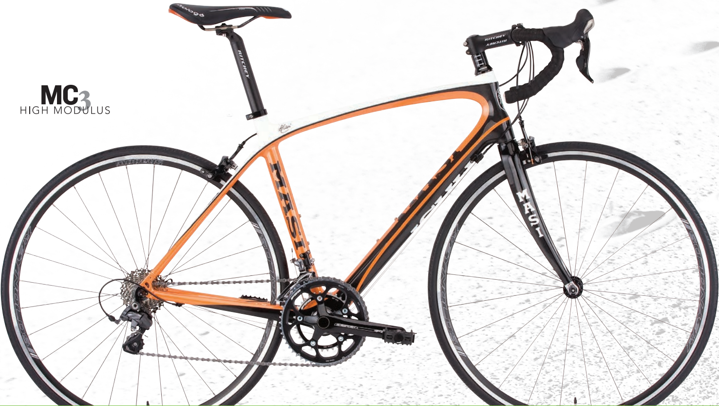
MC3 HIGH MODULUS