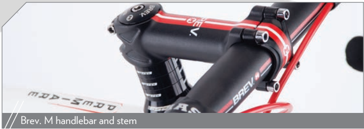
Brev. M handlebar and stem