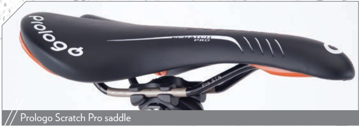
Prologo Scratch Pro saddle