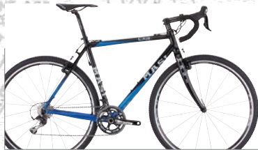
CXR COMP // 30