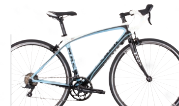
PC1 BELLISSIMA // 19