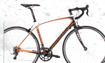
PC4 // 14

Available in four models, including two Bellissima models custom configured for women with zero offset seatpost, women's saddle, shorter stem and narrower bars, the 2013 Premiare represents a new direction for high performance road bikes. The Premiare frame paired with either a Masi FC/Pro or supple Elite/RS integrated carbon fiber fork rewards its owners with an unparalleled riding experience. And considering Premiare means "to reward" in Italian, we couldn't think of a better name for this technologically advanced machine designed with all the endearing attributes of a vintage Masi.