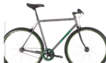
RISER // 40