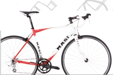
PARTENZA // 26