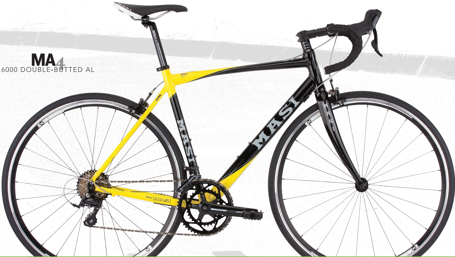
MA4 6000 DOUBLE-BUTTED AL

Whoever said a genuine racing bike has to be expensive has never heard of the Alare. Blending high technology features like a Masi MA4 double-buttressed aluminum frame with internal brake cable routing and an integrated headtube and carbon fiber fork with Shimano Sora shifting, the Alare delivers a serious performance punch. Offered in both traditional and women-specific Bellissima models, the Alare fits everyone for that perfect Masi ride.