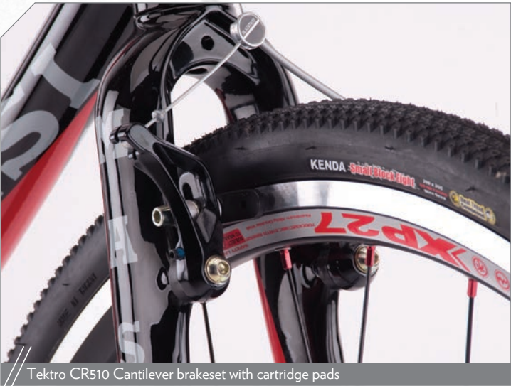
Tektro CR510 Cantilever brakeset with cartridge pads