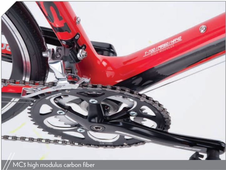
MC3 high modulus carbon fiber