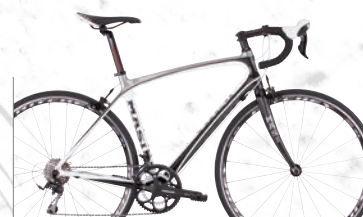
PC3 // 16