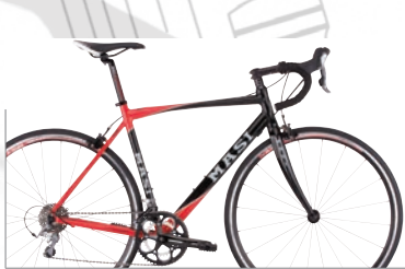
VINCERE // 24