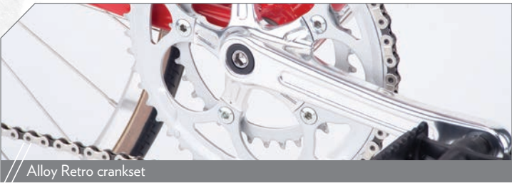
Alloy Retro crankset