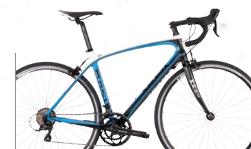
PC1 // 19