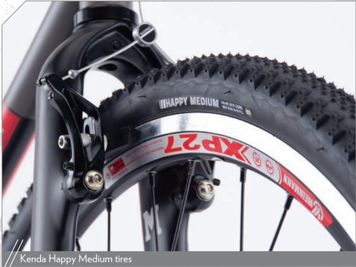
Kenda Happy Medium tires