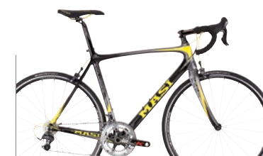
ULTEGRA // 09