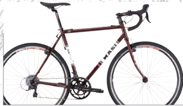
CX COMP // 32