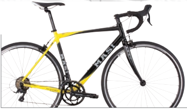
ALARE // 25