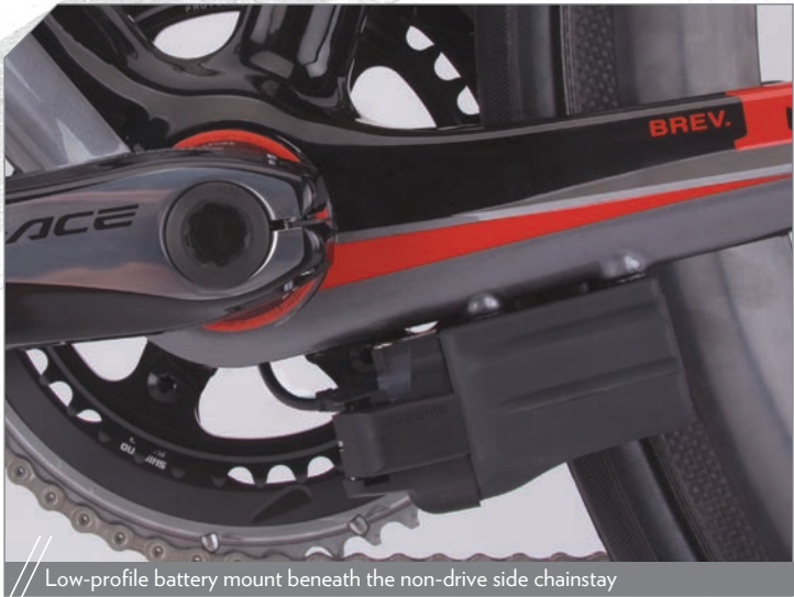
Low-profile battery mount beneath the non-drive side chainstay