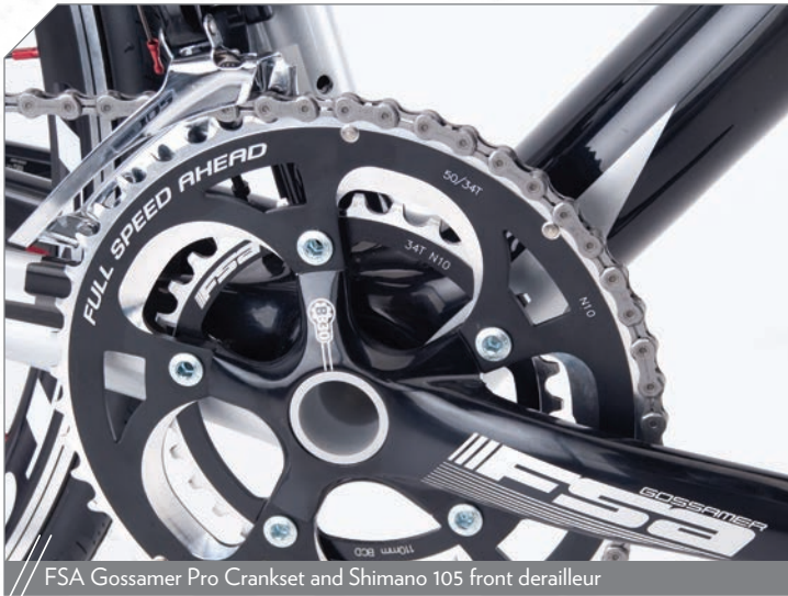
FSA Gossamer Pro Crankset and Shimano 105 front derailleur