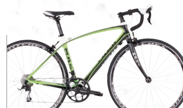
PC3 BELLISSIMA // 17