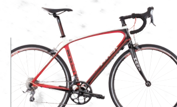
PC2 // 18