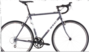
CX // 33