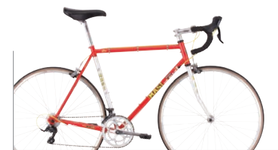
STRADA // 39