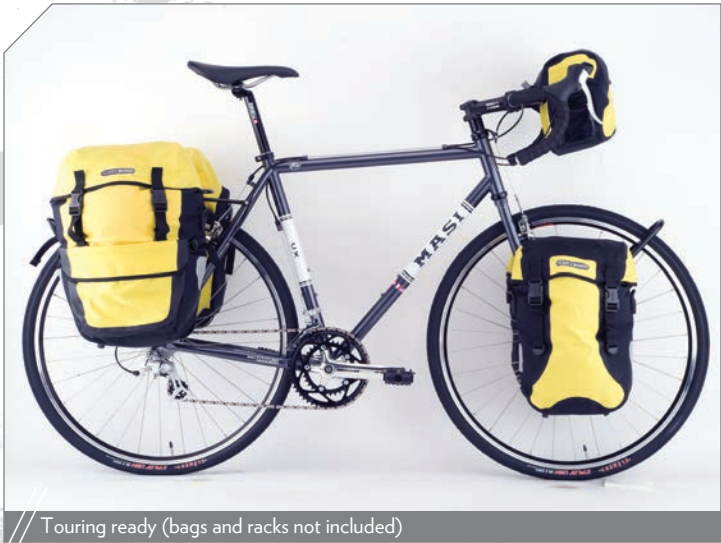
Touring ready (bags and racks not included)